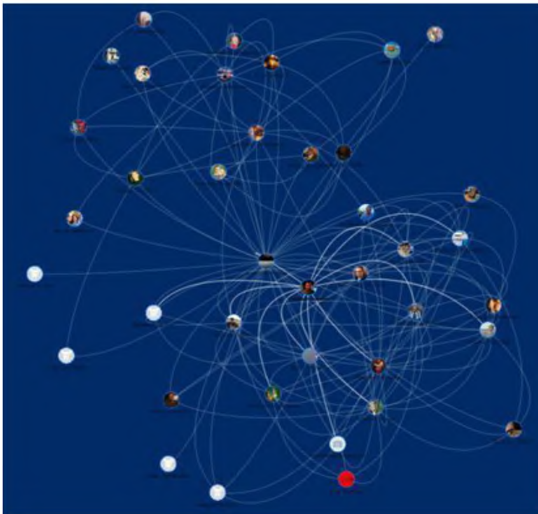
Fig. 2. Graf of contacts of the controlled participant of an ONS

Common words form a collocation - phrases that are signs of syntactically and semantically coherent units. This collocation receive new semantic value is not peculiar to their lexical components separately.