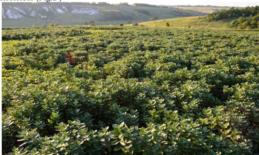
Figure 2. A. syriaca in soy crops (Stationary "Kulma", Novy Oskol urban district, Belgorod region).

Research has revealed that A.syriaca is a species that can potentially develop intensively in the conditions of major agricultural crops, causing significant economic damage. In the course of route research, fields with clogging of crops with this species were identified. It can form monodominant communities in a number of crops, forming monodominant thickets over large areas and demonstrating resistance to herbicides (Fig.2 )