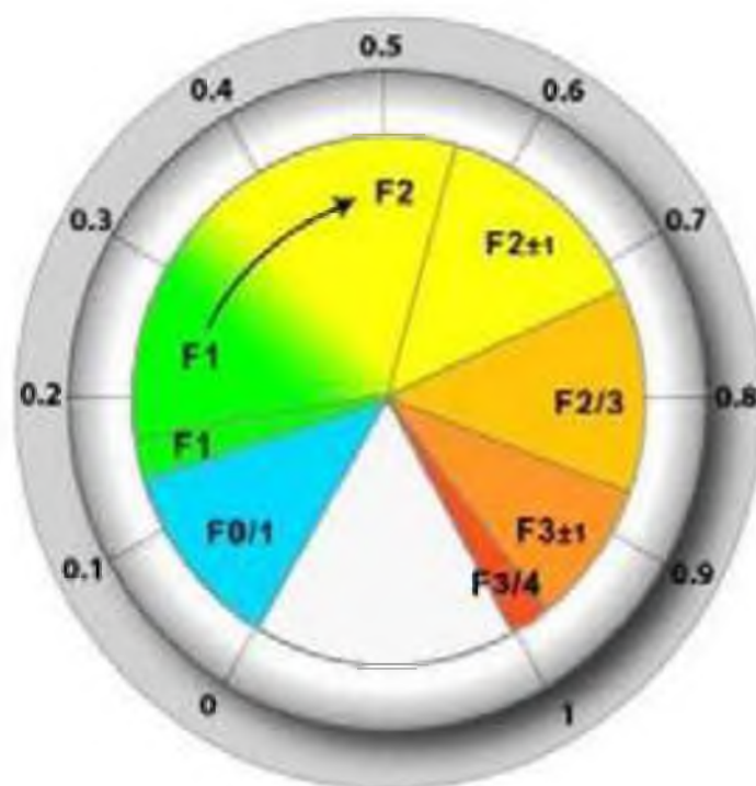
Fig.1. FibroTest and Fibrometer scales