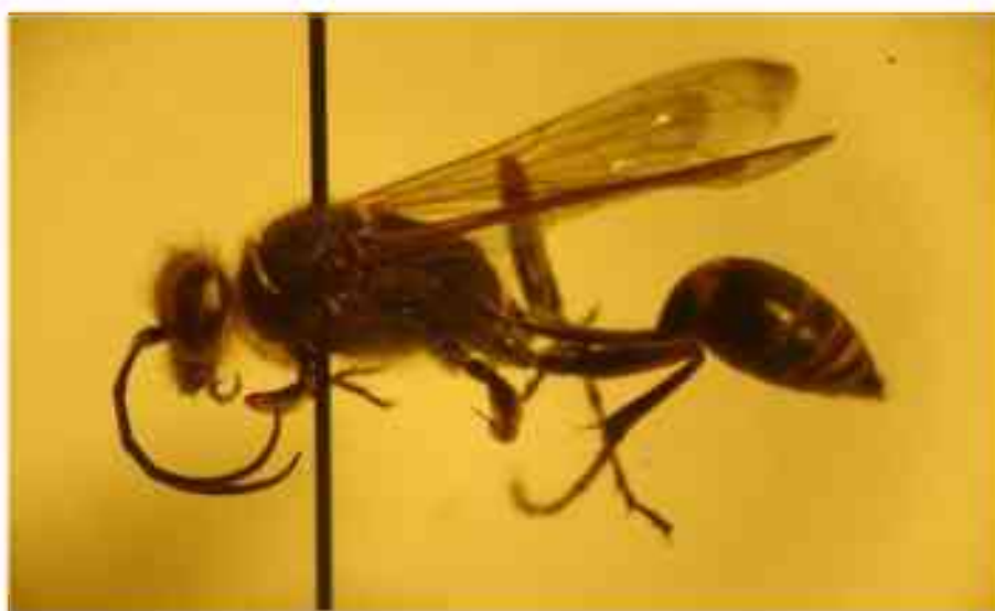
Fig. 1. General view of a specimen of Sceliphron curvatum (Smith, 1870), ♀, collected in Belgorod (Russia)

EXAMINED MATERIAL: Belgorod region, Belgorod, apartment (50.565180 N, 36.561865 E), 27.03.2021, 1♀, T.S. Cherkasova leg, Yu.A. Prisniy det. (Fig. 1).