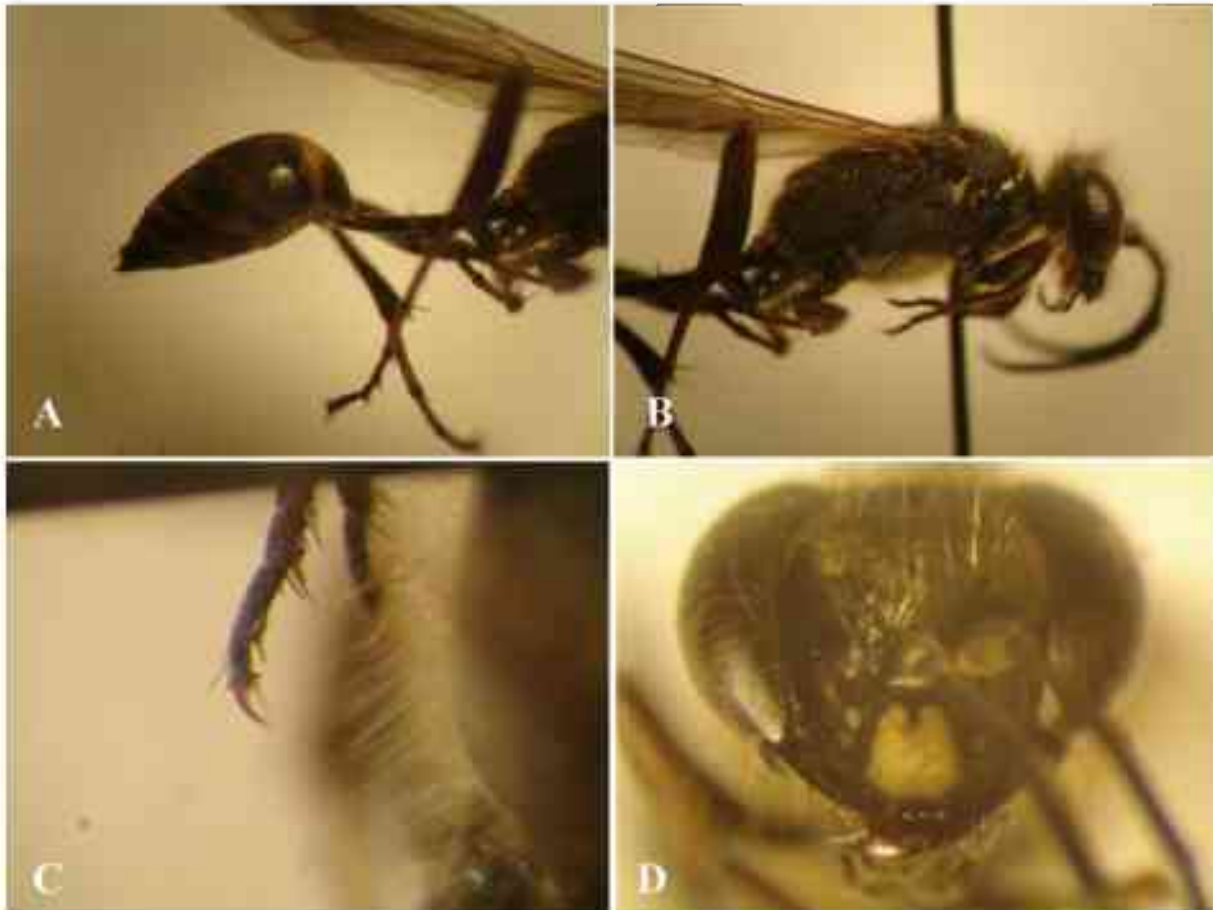
Fig. 2. Details of the structure and diagnostic features of Sceliphron curvatum (Smith, 1870), ♀, collected in Belgorod (Russia): A – petiolus and abdomen; B – chest; C – fore claw; D – head (front view)

The species were determined using taxonomic keys [Hensen, 1987; Schmid-Egger, 2005; Bitsch, Barbier, 2006]. Petiolus of female is black, in lateral view distinctly curved and apically not compressed; first abdominal tergite not swollen; mesoscutum dull, irregularly strigose, and with distinct shallow punctation between the striae over its entire surface; hypostomal carina does not reach base of mandibles; interocular distance at vertex distinctly longer than first flagellomere; fore claws untoothed; clypeus of female without lateral incisions (Fig. 2). The collected specimen was identified as Sceliphron curvatum (Smith, 1870) (see Fig. 1).