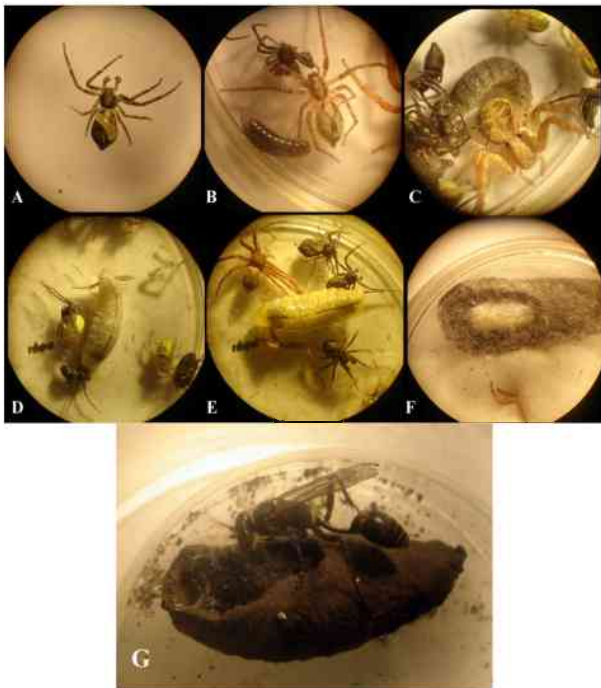
Fig. 5. Development of the larva of Sceliphron curvatum (Smith, 1870), discovered in May 2021 in Belgorod (Russia):

A – larva on T. piger extracted from 1 st cell (May 27, 2021); B – feeding of larva on A. accentuata (May 29, 2021); C – feeding of larva on Xysticus sp. (May 30, 2021); D – larva ate T. piger (May 31, 2021); E – spiders from the 2 nd cell offered to larva (June 1, 2021); F – cocoon in the cell (June 2, 2021); G – imago on earthen cell (June 20, 2021)