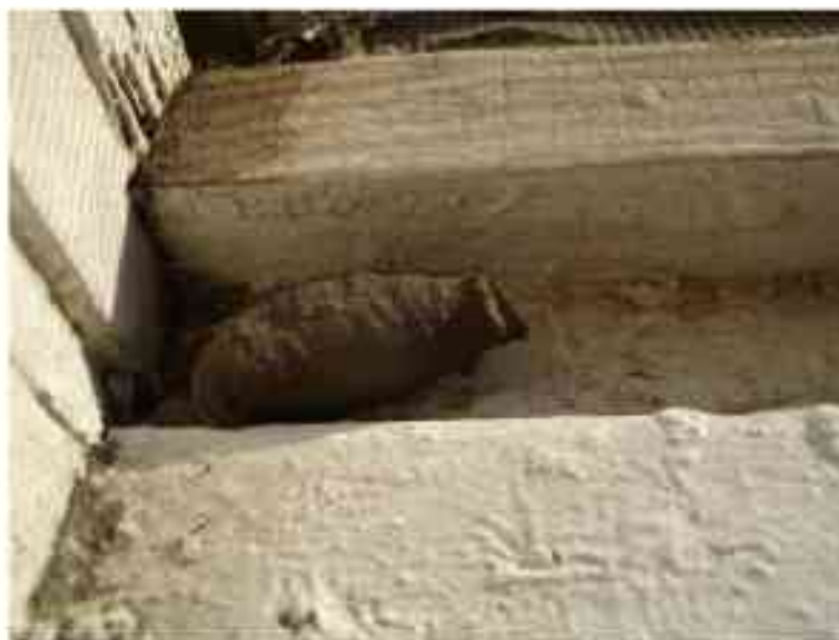
Fig. 3. Single cell of nest of Sceliphron curvatum (Smith, 1870), discovered in May 2021 in cavity of window frame of apartment in Belgorod (Russia)

On May 27, 2021, in cavity of a window frame, in apartment not far from place of finding of adult female, two single cells built of earth were found (Fig. 3). It is safe to say that this nest was built in May of this year by a wintering female S. curvatum , since there were no nests in this place at April.