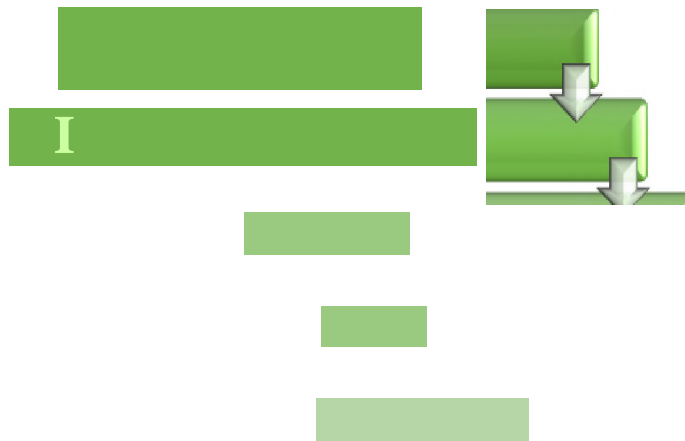
Fig. 1. The model of possible transformation of information