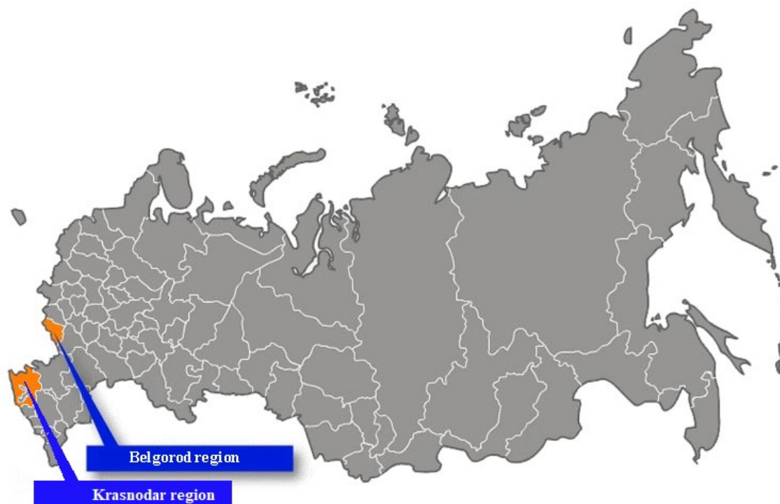
Figure 1. Regions where the study was conducted.

Figure 1 shows the location of these regions of the Russian Federation on the territory of Russia. The territories are located in the European part of Russia, separated from each other by distance of about 600 km, but their common feature is the dominance of chernozem soils.